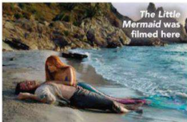
The Little Mermaid was filmed here

SOAK UP THE DISNEY PRINCESS DREAM ON THIS IDYLIC ITALIAN ISLAND