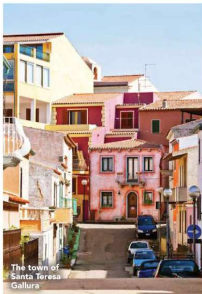
The town of Santa Teresa Gallura