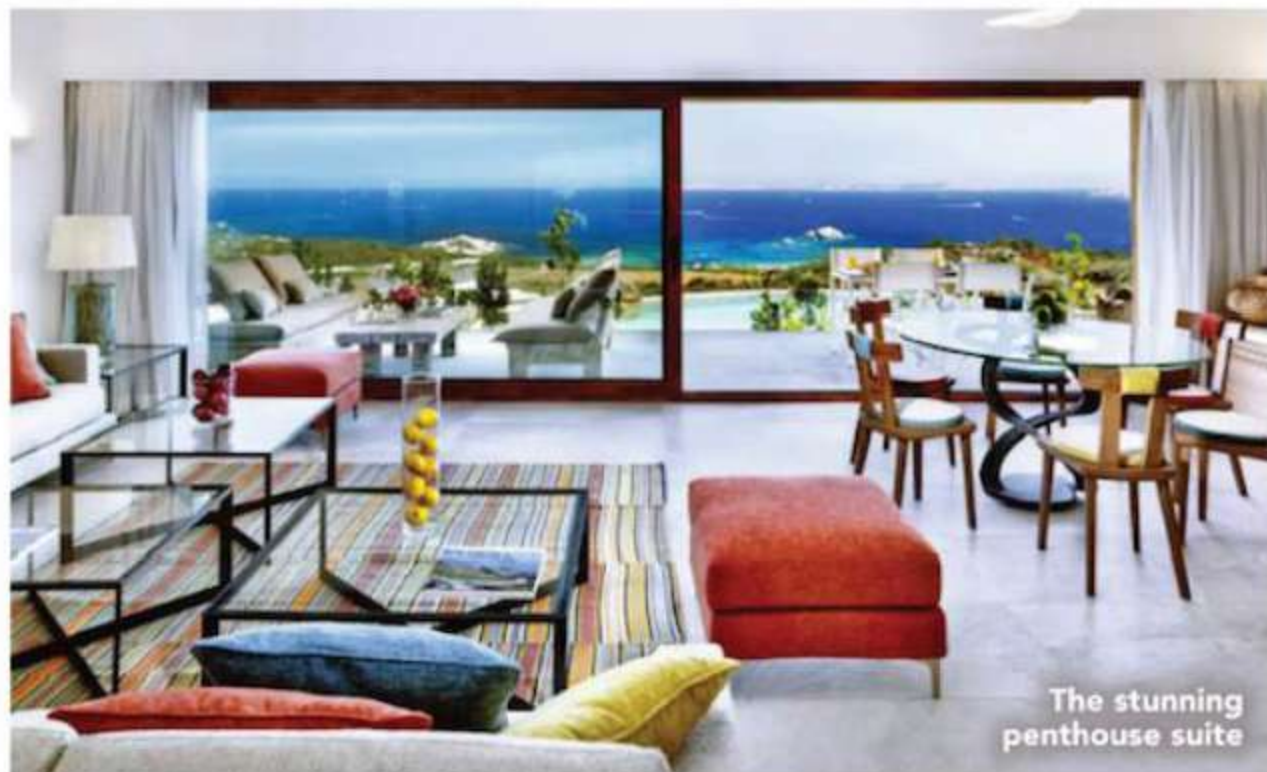
The stunning penthouse suite