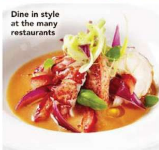
Dine in style at the many restaurants