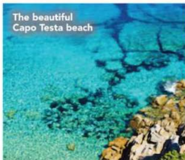
The beautiful Capo Testa beach