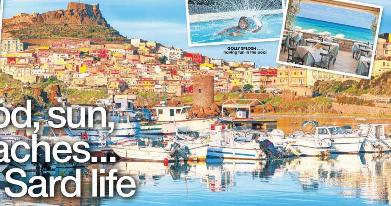
PICTURESQUE... historic town of Castelsardo