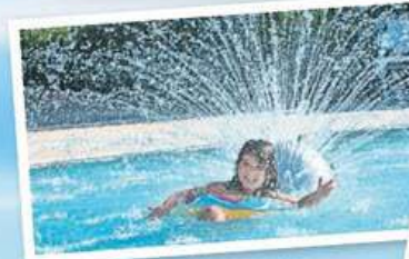
GOLLY SPLASH... having fun in the pool