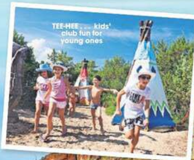
TEE-HEE... kids' club fun for young ones