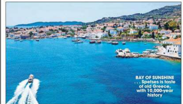
BAY OF SUNSHINE... Spetses is taste of old Greece, with 10,000-year history

The Authentic Greece Island Hopping Experience starts from £1,439pp for nine nights travelling this summer, including all accommodation, flights and on the ground transfers. For all details, see olympicholidays.com.