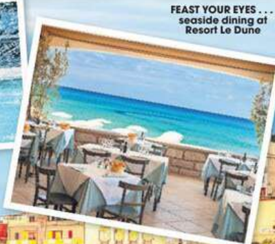
FEAST YOUR EYES... seaside dining at Resort Le Dune