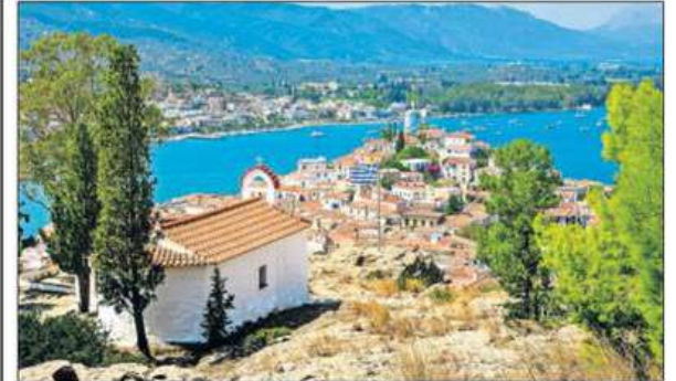
MED IN HEAVEN... Poros has a traditional vibe and is not without nightlife