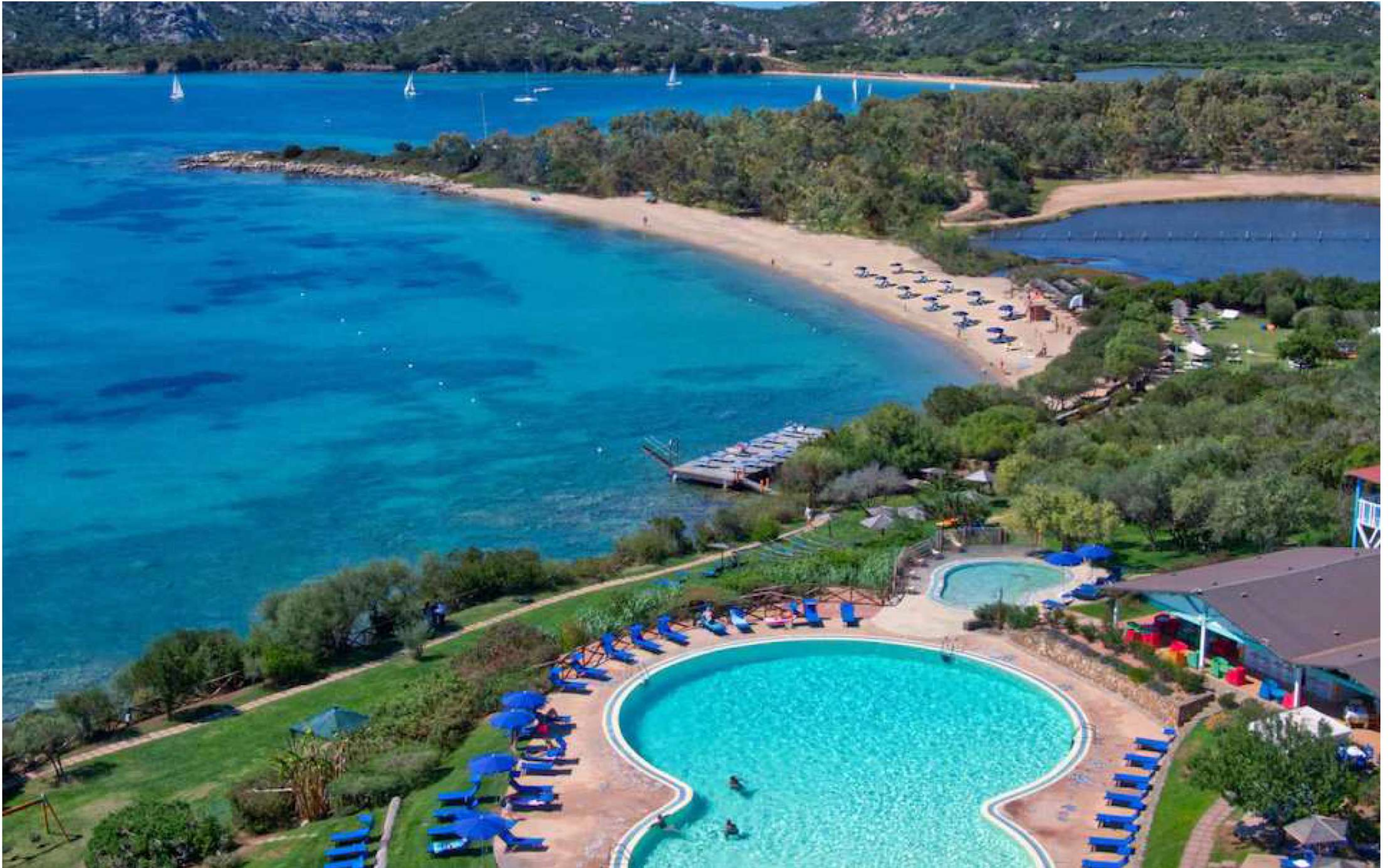
There's plenty to entertain children at the Park Hotel and Spa Cala di Lepre

From £84 per person per night, half board; hotelcaladilepre.com